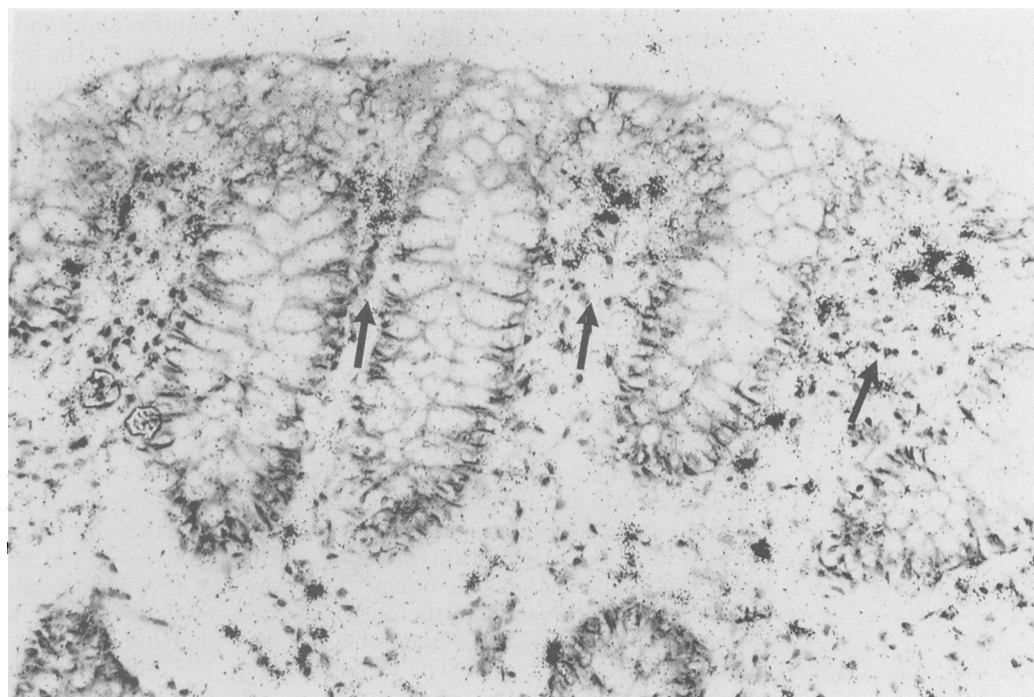
Figure 1: Section of healthy colonic mucosa, >5 cm from a carcinoma showing lysozyme mRNA in cells situated just below the epithelial basement membrane (arrows).

A three stage immunoperoxidase technique was used in specimens stained with the KP1 antibody. Briefly, after blocking of endogenous peroxidase activity, sections were first incubated with the primary antibody, rinsed, incubated with a peroxidase-conjugated rabbit anti-mouse antibody (diluted in Tris buffered saline/normal human serum), rinsed and incubated with a peroxidase conjugated swine anti rabbit antibody. Developing and mounting were per-