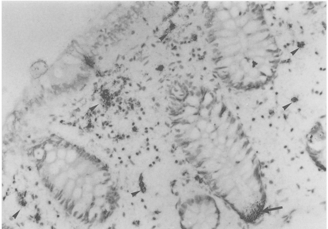
Figure 2: Lysozyme mRNA in ulcerative colitis. Positive cells lie below the basement membrane as well as in the deeper lamina propria (arrowheads). Metaplastic Paneth cells are also expressing the mRNA (arrow).

formed according to the same protocol as for the PAP procedure.