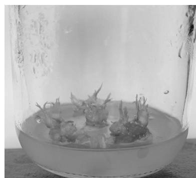
Fig.2 Dumpy and twisty buds induced by MS medium supplemented with higher concentrations of BA ( \geq 2.6 \mu\text{mol/L} )

For root induction, before being transferred to 1/2 MS medium without growth regulators, 2 cm long or longer shoots were cut and immersed in sterilized different concentration auxin for different time. The frequency of rooting and the number of roots were observed about 2 weeks later (Table 2).