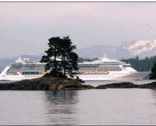
Concentrated living quarters of cruise ships can facilitate large-scale outbreaks of gastroenteritis caused by Norwalk-like viruses.

Once an outbreak has occurred, the challenge of implementing control measures must be tackled. 10 Food handlers with symptoms of vomiting or diarrhea should be excluded from work immediately and should not return to work until at least 48 hours after the