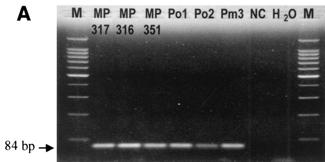
FIG. 1. Specificity of the PCR-based method for detecting four species of human malaria parasites. (A) Agarose gel electrophoresis of PCR-amplified products with SSU rRNA primers. Lanes: MP 317 and MP316, P. falciparum samples; MP 351, P. vivax sample; Po1 and Po2, P. ovale samples; Pm3, P. malariae sample; NC, noninfected sample (negative control); H 2 O, no-template control; M, molecular size markers. (B) Amplification plot for the samples listed in the legend for panel A, with the threshold being set at 150 relative fluorescence units (RFU).