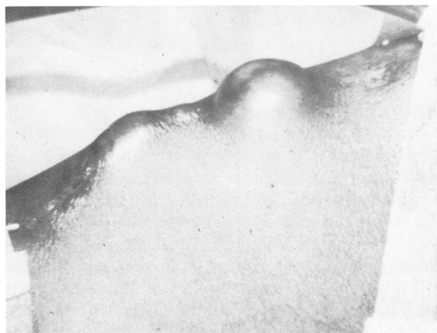
FIG. 3. Photograph of an arm with BCH 18 months after operation. Two aneurysms are clearly seen.

The primary arteriovenous fistula has rightly become the preferred method of access to the circulation for chronic hemodialysis. At our institution, it was attempted on 350 occasions, when there was a possibility