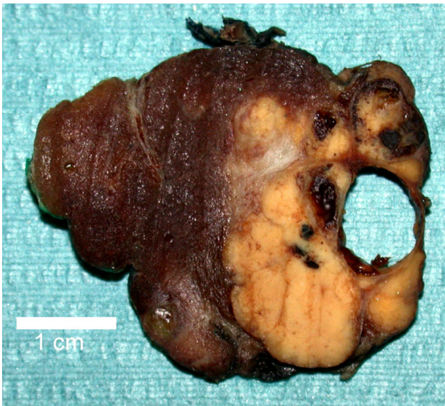
Figure 1 Gross appearance of parathyroid tumour and thyroid lobe.

(2%) were diagnosed with distant metastasis to lung or bone at their initial presentation.