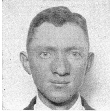
FIG. 6.—Case II. Three months after operation.

nasal bones. Up to this time no diagnosis had been made; a later consultant was supposed to have given her some "blood medicine" and the ulceration rapidly healed. She came to the Gray Clinic in Atlanta in 1920, examination