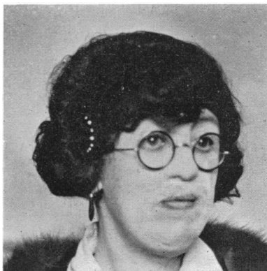
FIG. 4.—Case I. Showing patient six months after the nose and lip operation has been completed.

I prefer cartilage to bone, which can be easily obtained from the ninth costal cartilage. In this case it is best to cut the cartilage to the size and shape desired, leaving on all the perichondrium possible, embed this in centre of the flap to be used from the forehead ten days prior to the operation in