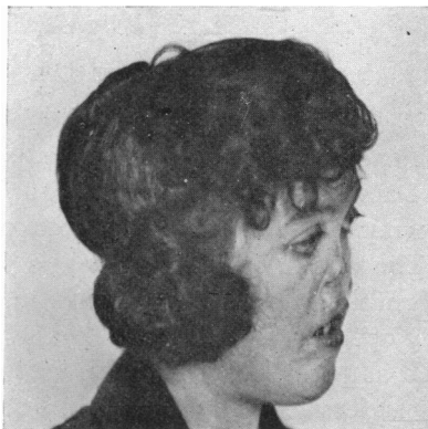
FIG. 2.—Case I. Profile.

If bone is to be used for the bridge it can be taken from the outer table of the frontal bone of the forehead attached to the flap to be used for the skin covering.