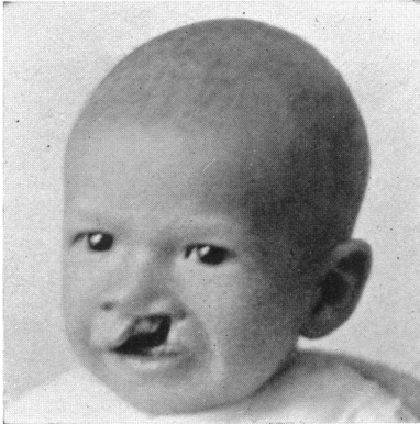
FIG. 7.—Case III. Shows baby three months old with unilateral harelip with wide cleft through alveolar process extending through horizontal process of palate with deviation of nasal septum to the right.

nasal bones. Up to this time no diagnosis had been made; a later consultant was supposed to have given her some "blood medicine" and the ulceration rapidly healed. She came to the Gray Clinic in Atlanta in 1920, examination