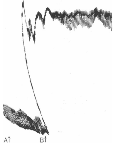
Fig. 1. 1 in. of jejunum of rabbit suspended in Tyrode solution (25 c.c.). A-B , normal rhythmic contractions. At the point B , 0.1 mg. secretin was added to the solution giving a concentration of secretin of 1 : 250,000.

0.1 mg. of secretin was added to the Tyrode solution (25 c.c.), the concentration of secretin being 1 : 250,000. A large increase in the general tonus of the muscle was produced, this being followed by a return of the rhythmic contractions at the higher tonic level (Fig. 1). After the solution was removed and replaced by Tyrode solution the intestine returned within a few minutes to its original condition. Fig 2 shows the effect of adding 0.03 mg. of secretin to the Tyrode solution, the concentration of secretin in this case being 1 : 750,000. The resulting increase in tone was small, indicating that a concentration of secretin less than this quantity does not affect intestinal muscle.