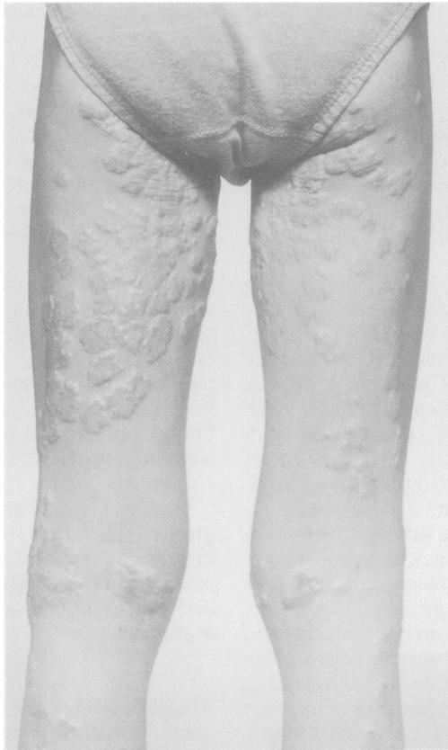
Figure 2: Xanthelasma in a 10 year old boy with Alagille's syndrome.

longation of the prothrombin time. All have hepatomegaly and approximately 50% have splenomegaly. Those presenting with a severe bleeding episode do so at two to six weeks of age. The prothrombin time (prothrombin ratio) is greatly prolonged. It reverts to normal within six hours with intravenous vitamin K. Rarely the presentation is with ascites in the newborn period. The course of the liver disease is independent of the mode of presentation in infancy.