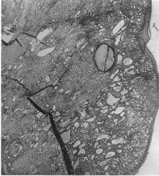
FIG. 3.—Microphotograph of cavernous angioma of spleen (low power).