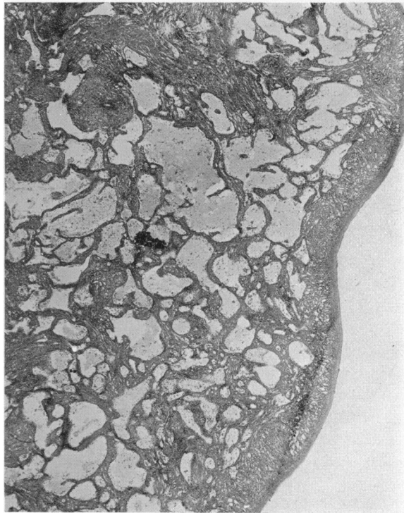
FIG. 4.—Microphotograph of cavernous angioma of spleen (high power).