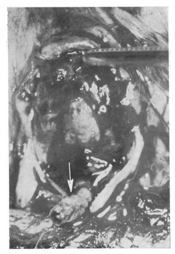
Fig. 4 Thrombosed caudal mesenteric artery three weeks after the ameroid device had been applied. (Device removed before the photograph was taken.)

was a linear decline in mean blood flow in the inferior mesenteric artery, so that a flow of the order of 120 ml per minute in the fourth decade is reduced to approximately 10-15 ml per minute in the eighth decade.