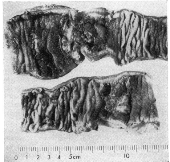
Fig 2 Chronic ulcerative enteritis. Multiple ulcers, varying in size, are present in the resected jejunum.

Examination of the resected specimen showed two large deep circumferential ulcers 4 cm and 3 cm in diameter, as well as 13 other shallow ulcers distributed in irregular fashion along the mucosa (fig 2). The latter ranged in size from 3 cm to 3 mm in diameter. The mesentery was thickened and oedematous. The regional mesenteric lymph nodes were enlarged to 3 cm diameter and soft in consistency.