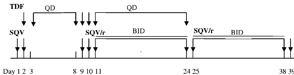
FIG. 1. Dosing schema. Day 1, administration of a single 1,000-mg dose of saquinavir mesylate (SQV) in the morning; day 2, coadministration of a single 300-mg dose of tenofovir DF (TDF) with a single 1,000-mg dose of SQV in the morning; days 3 to 8, administration of a single 300-mg dose of TDF once daily (QD) in the morning; day 9, coadministration of a single 300-mg dose of TDF and a single 1,000-mg dose of SQV in the morning; day 10, coadministration of a single 300-mg dose of TDF and a single 1,000/100-mg dose of ritonavir-boosted saquinavir (SQV/r) in the morning; days 11 to 24, coadministration of 1,000/100 mg of SQV/r twice daily (BID) in the morning and evening with a 300-mg dose of TDF QD in the morning; days 25 to 38, administration of 1,000/100 mg of SQV/r BID in the morning and evening; day 39, administration of a single 1,000/100-mg dose of SQV/r in the morning.

(This study was presented in part at the 44th International Conference on Antimicrobial Agents and Chemotherapy, Washington, D.C., 30 October to 2 November 2004.)