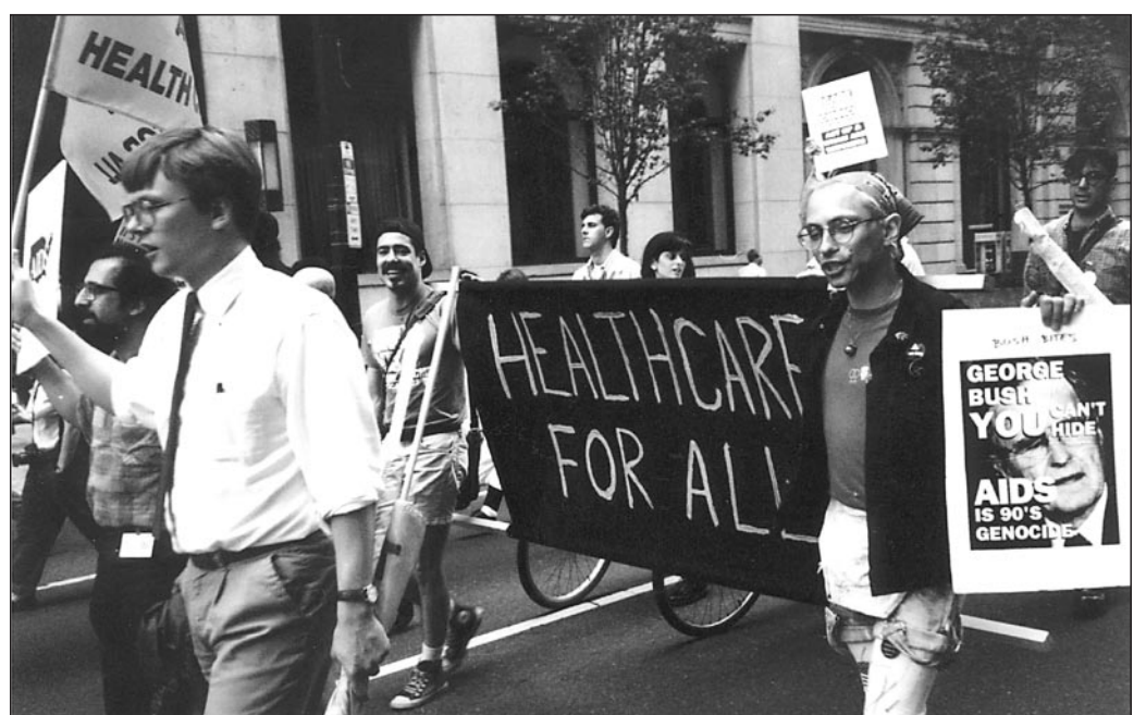
AIDS activists join in the April, 1992, Health Care for All/Philadelphia march.

Since the end of the Clinton health care campaign, public discontent with the medical system