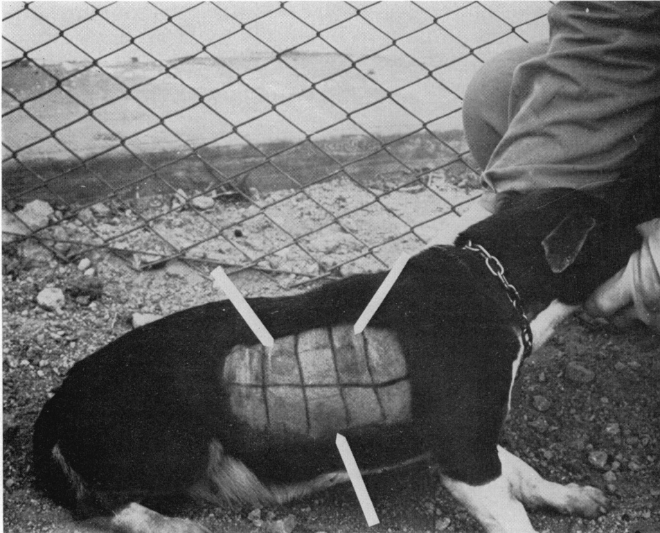
FIG. 1. Passive cutaneous anaphylactic reaction in recipient animal inoculated intradermally with sera from dogs infected with E. granulosus . Intravenous challenge with antigen and Evans blue followed 48 hours later. The arrows mark the blue stained areas of positive reactions.

The reaginic antibody activity was destroyed in all positive sera by heating to 56° for 30 minutes. Treatment with 2-mercaptoethanol resulted in complete loss of activity. Lyophilization of positive sera was found not to reduce skin sensitizing ability. Thus far attempts further to characterize the antibody using Sephadex G-200 columns and sucrose gradient ultracentrifugation (according to the methods of Rockey and Schwartzman, 1967) have not been successful. A satisfactory separation of the major immunoglobulin