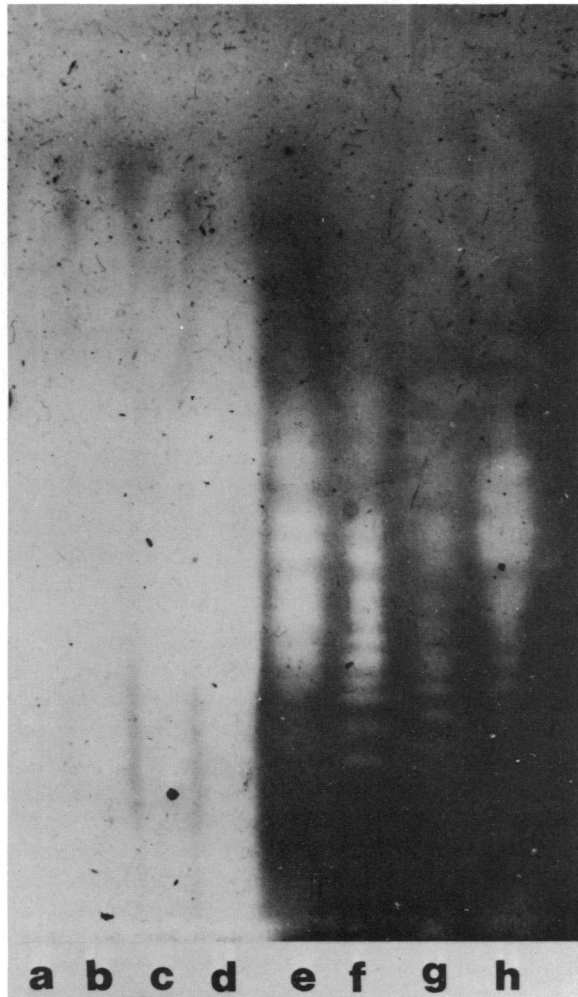
Figure 3. The isoelectric spectra of anti-SRBC antibodies in untreated mice (a and b), and those which had been thymectomized only (c and d), both thymectomized and injected with ATS (e and f) or given ATS only (g and h). All eight sera had 2-mercaptoethanol resistant agglutinin titres of 7. Sera a, b, c, d, g and h were obtained 14 days after one injection of SRBC. Serum e was obtained after ten injections of SRBC and serum f after seven injections.

1968). Both IgM and IgG antibodies probably make significant contributions to the operational class of haemagglutinating antibodies.