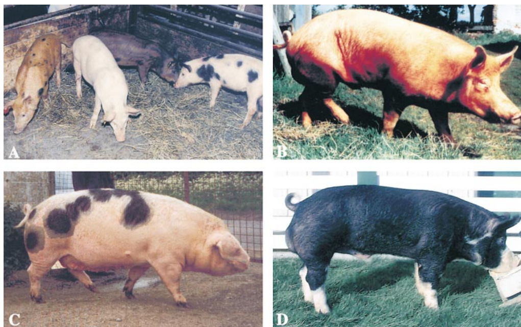
FIGURE 1.—Illustration of pig coat color phenotypes associated with the E^p allele at the Extension/MC1R locus. (A) F_2 progeny from a wild boar/Large White intercross. The leftmost animal ( E^p/E^p ) is red with black spots; this is very similar to the phenotype observed in Linderöd pigs (not shown). The rightmost animal ( E^p/E^p ) is white with black spots; this is similar to the phenotype observed in Pietrain pigs (not shown). The second animal from the right is heterozygous E^+/E^p and shows the wild-type color but with a black spot on the lower right side, indicating a somatic reversion. The second animal from the left is white due to the presence of the Dominant white allele. (B) Tamworth. (C) Gloucester Old Spot. (D) Berkshire.

arily conserved regions of MC1R to amplify 758 bp comprising the major part of the porcine MC1R coding sequence but the analysis did not include the 5' and 3' ends (KIJAS et al. 1998). These missing parts have now been sequenced using subclones from BAC 978E4 containing MC1R ; the sequence has been deposited in GenBank with accession no. AF326520. The result revealed a gene encoding a receptor three amino acids longer than the corresponding mammalian homologs (Figure 2). The length difference is due to an apparent tandem duplication of codons 29–31. The amino acid level sequences identified within the first 40 residues were highest for pig and human (70.0%), followed by pig/cattle (65.0%) and pig/mouse (55.0%). These values are lower than those previously reported for the middle part of MC1R (average 79%), indicating that the amino terminal region is less well conserved.