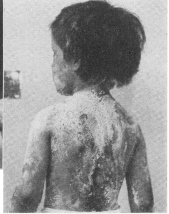
FIG. 4. IV. 1 after thermal stimulation.

volume after chemical stimulation represents another area in which physiological response is suboptimal.