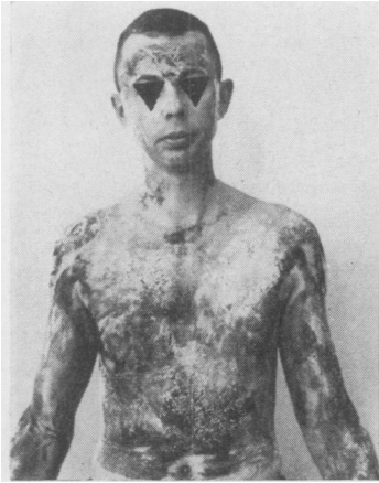
FIG. 2. Control after thermal stimulation.