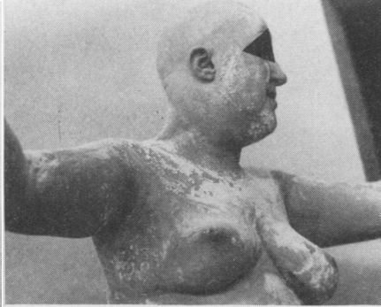
FIG. 3. III. 5 after thermal stimulation shows perspiration under left breast.