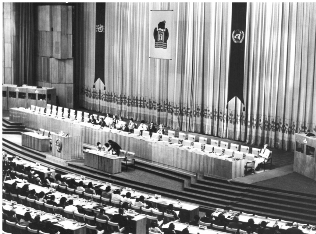
Alma Ata Conference, 1978.

These new approaches were spearheaded by Halfdan T. Mahler, a Dane, who served as director general of WHO from