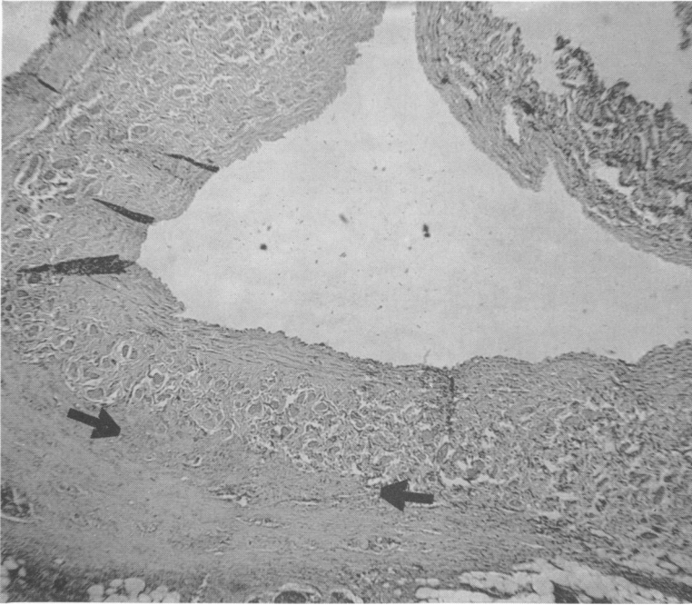
FIG. 2. Histologic section of the superior mesenteric vein showing infiltration of adventitia by carcinoma (between arrows). H & E \times 35 .

probably related to the edema and congestion of the bowel resulting from prolonged occlusion of the superior mesenteric vein.