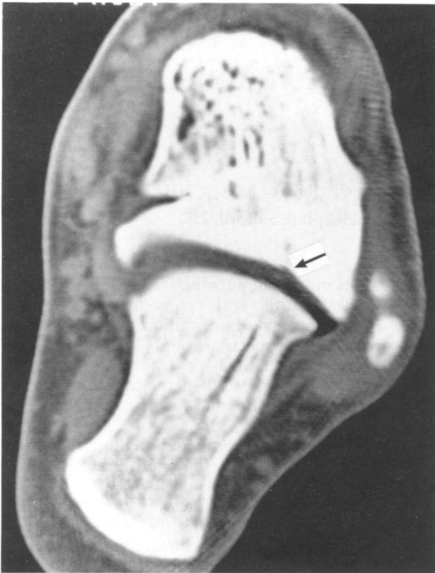
Figure 2. CT scan showing fracture line in the lateral talus (arrow)

Union of undisplaced fractures can usually be anticipated with conservative treatment, but non-union can occur, particularly in displaced fractures 1 .