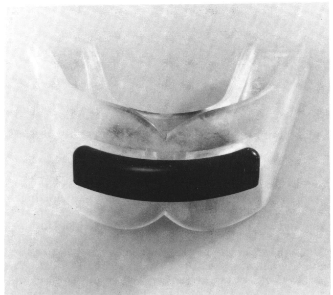
Figure 3. Frontal view of bimaxillary mouthguard 3