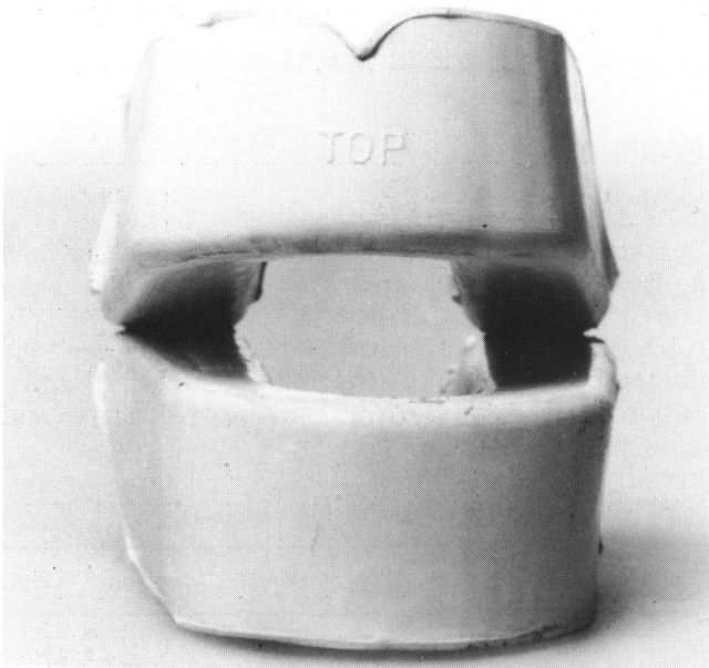
Figure 2. Frontal view of mouthguard 2 which is identical in structure to mouthguard 1 except it is bimaxillary with a hinge component