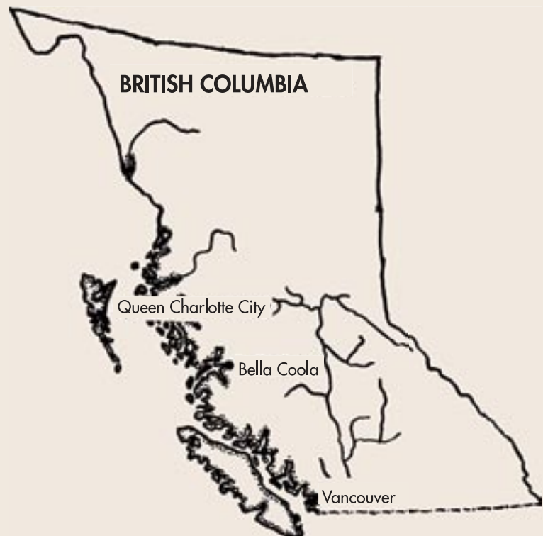
Figure 1. Location of Queen Charlotte City and Bella Coola Valley within British Columbia

Postal codes corresponding to each hospital's local health area (defined as the hospital's catchment area) were obtained from Canada Post and forwarded to the BC Vital Statistics Agency in Victoria. 27 The agency then provided birth data for the two communities and identified mothers