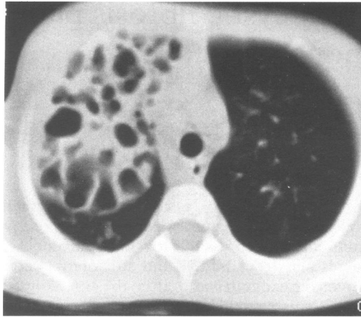
Figure 1 Preoperative computerised tomography scan of case 2.

increased peribronchial thickening elsewhere. A CT scan confirmed bronchiectatic destruction of the right upper lobe but normal appearances throughout the rest of the lungs (fig 1). She underwent right upper lobectomy and made an uneventful recovery. At six months follow up she is no longer producing sputum.