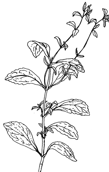
FIGURE 1. Stevia rebaudiana Bertoni.

chemically ent-13-hydroxy kaur-16-en-19-oic acid. As shown in Figure 2, stevioside is the main sweet glycoside, 6-8%, in dry stevia leaves (10).