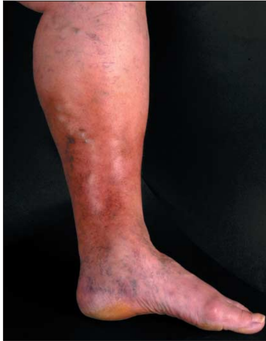
Fig 1 Skin changes (lipodermatosclerosis) caused by venous hypertension. Recognition of skin damage is fundamental in examination of varicose veins

wearing support hosiery, and tenderness over the veins.