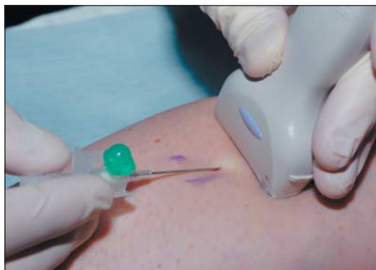
Fig 4 Foam sclerotherapy: the short saphenous vein is being cannulated under duplex ultrasound guidance before injection of foam

*Many variations exist: for example, radiofrequency or laser treatment may be done alone or in combination with phlebectomies or sclerotherapy (conventional or foam) in a single procedure or in separate procedures. What is possible in a single session depends on the type of anaesthesia used (general, regional, or local): although varicose vein surgery is usually done under general anaesthesia, spinal or extensive local infiltration can be used.