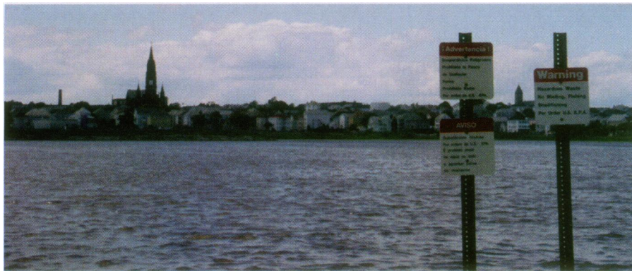
Figure 1. View of a New Bedford, Massachusetts, neighborhood adjacent to the PCB-contaminated New Bedford harbor estuary. Notices posted along the shore advise "Warning, hazardous waste, no wading, fishing, shellfishing per order US EPA."