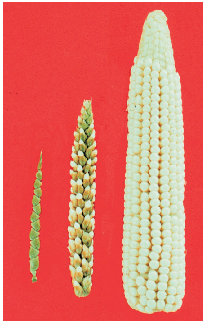
Figure 2. Modern corn hybrid (right), its wild relative teosinte (left), and their hybrid (cob in the center).

To address the concern about long-term health consequences of GM foods, it is instructive to recognize that we worried little about such impacts when massive amounts of new proteins (and unfamiliar chemicals) were introduced into our foods from wild species or when unknown changes were created through mutation breeding. When new foods from exotic crops are introduced, we often assimilate them easily into our diets. What’s more we rarely, if ever, before asked the same questions that we now pose about GM crops. Many so-called functional foods, health foods, and nutraceuticals have been entering into the mainstream American diet lately, with little or no regulation or testing. We do not question the long-term health implications of these food supple-