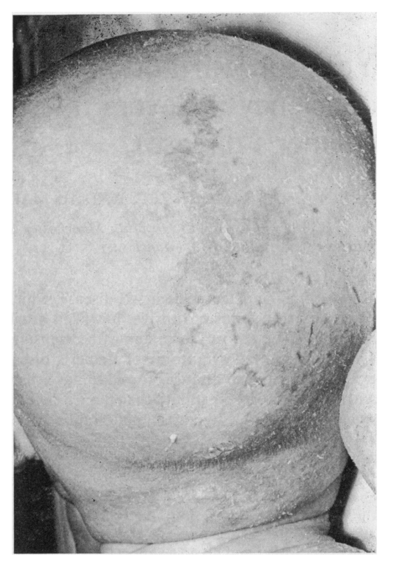
Fig. 1 Case 1. Scalp showing dermatitis with atrophic areas.

Case 1. A first child, born on 27 April 1972. After a normal pregnancy and delivery, he developed dry skin and started vomiting. Milk allergy was diagnosed and he was treated with a soya bean milk and corticosteroids orally and locally. He failed to