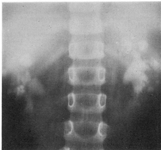
Fig. 1 Renal tomogram before treatment showing bilateral staghorn calculi and multiple clusters of smaller calculi.

A plain x-ray showed the presence of bilateral renal staghorn calculi, with clusters of smaller stones in the calyces (Fig. 1). An intravenous urogram showed mild bilateral caliectasis without