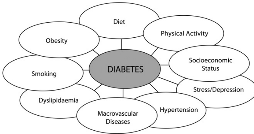
FIGURE 1—Factors associated with type 2 diabetes as a “composite” chronic disease.