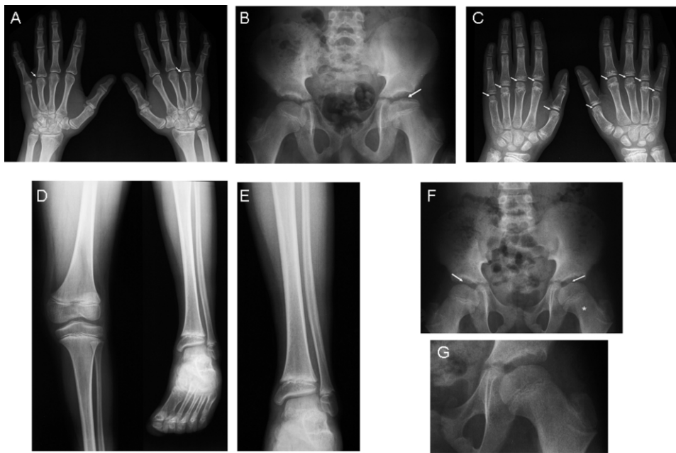
Figure 4. A , Standard radiograph of the hands and wrists of individual II.3 at age 20 years. Flattening, underdevelopment, and squaring of the heads of the metacarpal bones, particularly at metacarpal IV bilaterally, are indicated ( arrows ). Also note bilateral clinodactyly as an incidental finding. B–E , Radiographs of individual II.9 at age 10 years. B , Standard radiograph of the pelvis. Flattening and irregular delineation of the left femoral epiphysis are indicated ( arrow ). Also note the broadening of the femoral neck, particularly at the left side. C , Standard radiograph of the hands and wrists. Subtle flattening and squaring of the metacarpal heads are indicated ( arrows ). D , Standard radiograph of the left knee and lower leg. Note slight overtubulation and narrowness of the diaphyses of the femur, tibia, and fibula. E , Detail of the left tibia and fibula. F , Standard radiograph of the pelvis of individual II.10 at age 7 years. Slight flattening and irregularity of the femoral epiphyses are indicated ( arrows ). Also note the broadening of the femoral neck, particularly at the left side ( asterisk [*]). G , Spot view of the slightly flattened and irregular left femoral epiphysis of individual II.10.

exon 3 in the other two COL9 genes. Therefore, it was surprising that the splice-site mutation in COL9A1 that causes MED did not result in skipping of exon 9. The reason why mutations group around the donor/acceptor sites of exon 3 in COL9A2 and COL9A3 and around exon 8 in COL9A1 is not yet clear. It is plausible that the resulting deletion of amino acids from this domain of type IX collagen may disrupt interactions with other components of the cartilage. This may be caused by the deletion of a binding site within the COL3 domain. Another possibility is that the orientation of the \alpha 1(\text{IX}) NC4 domain relative to the type II/XI collagen fibril is changed by the mutation.