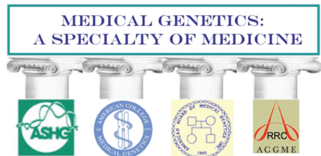
Figure 2. Quadripartite structure of the medical genetics edifice.

...the use of industrialized methods of data acquisition and analysis to improve medical care, including