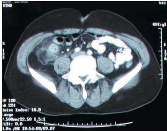
Fig 1 Computed tomography scan showing inflammatory mass in right iliac fossa secondary to acute appendicitis

However, two prospective studies have evaluated the use of computed tomography, and both showed a decrease in the number of unnecessary admissions and appendicectomies. w10 w11 Importantly, some authors have highlighted the risk of unnecessary exposure to ionising radiation caused by excessive use of computed tomography scans, and low dose protocols have been advocated. w12