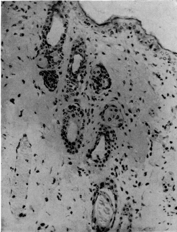
FIG. 5. Section of skin through a macule developed during serum sickness in a guinea-pig given 2 ml normal rabbit serum intraperitoneally for 6 days. Note dilated blood vessel without any perivascular infiltration as in Fig. 4. H & E, \times 200 .

Anti-polymorphonuclear leucocyte serum in a dose of 1 or 2 ml was injected intraperitoneally 2 days before the intravenous injection of 20 mg/kg K_2Cr_2O_7 . This treatment depleted the circulating polymorphonuclear leucocytes completely in eight out of twelve animals, without having much effect on the number of circulating lymphocytes. This treatment abolished the flare-up reaction completely in seven out of the twelve animals treated in this way and reduced the reaction in three others (Table 3).