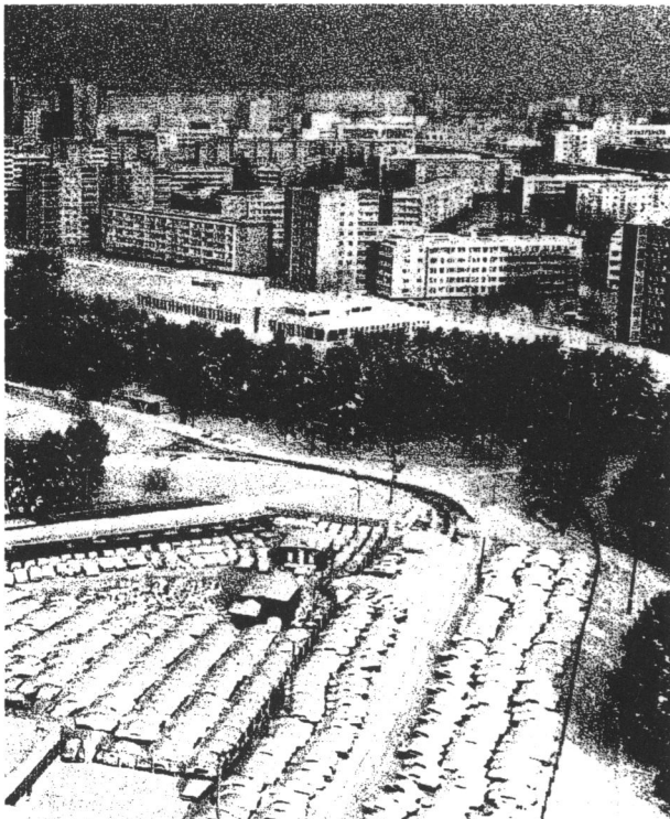
Pripjat, population 45,000, was the largest city affected by the Chernobyl accident. It is expected to be a ghost town for the foreseeable future. "Snow" is radioactive fallout.