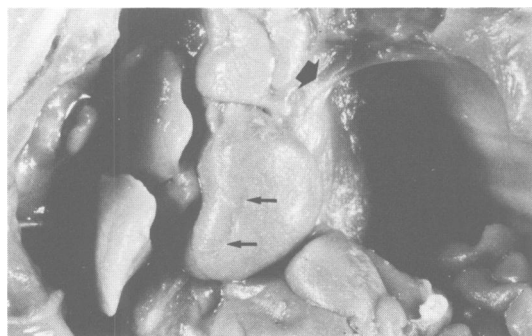
Fig 3 Thoracic contents showing absence of left lung and hemidiaphragm, persistent left superior vena cava (broad arrow) and abnormal cardiac outline with hypoplastic right ventricle. Small arrows indicate anterior descending coronary artery. Loops of intestine protrude into left hemithorax, and right lung is relatively well developed (case 5).