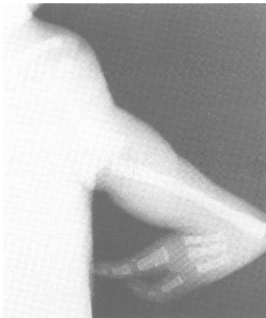
Fig 2 X-ray showing radial aplasia, absent thumb, and macrosyndactyly (case 4).

caesarean section for fetal distress. A malformed female infant was delivered and the Apgar scores were poor (fig 2). Medical support was discontinued after two hours. The abnormalities found at necropsy are listed in table 2.