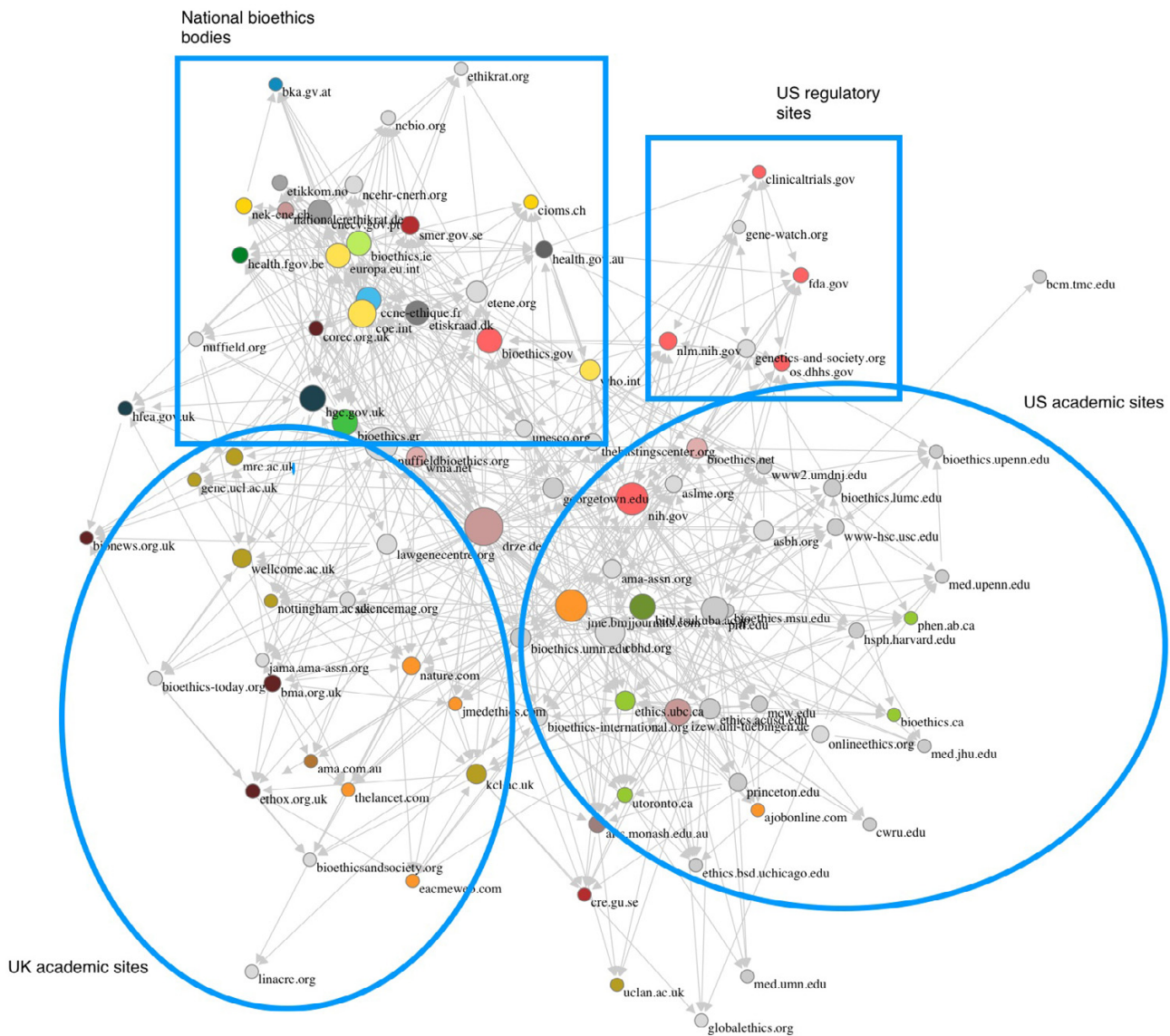
Figure 1 Web-linking according to in-links.

In both website maps, it is possible to identify 4 main clusters: 1) a tightly linked cluster consisting mainly of websites of official, national bioethics bodies; 2) a loosely