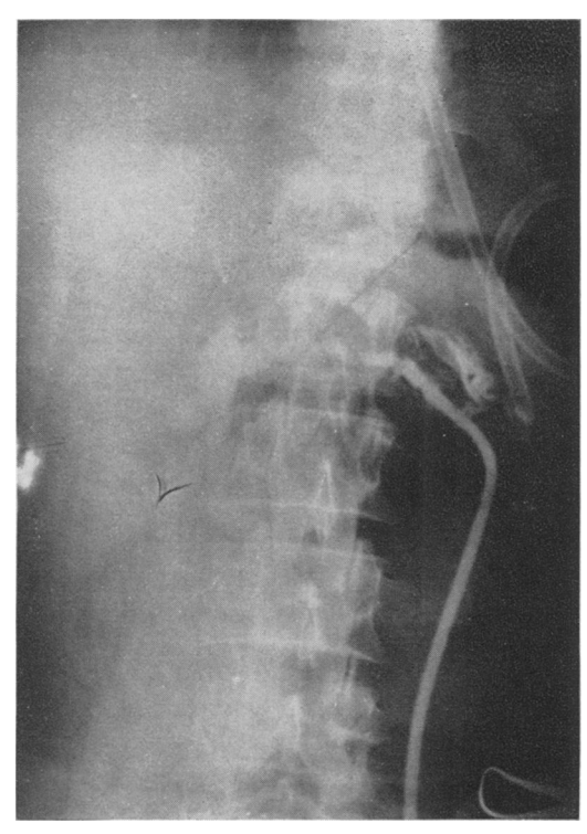
Fig. 3. Pancreatogram at operation (Case 2).

his wound healed satisfactorily. He was encouraged to take those foods at mealtime which had been denied him for the previous 9 years, which he did with much enthusiasm and without distress.