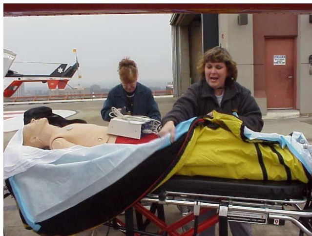
Figure 2 Simulator Ready for Loading into Position.

The aircraft was run at flight idle setting to provide noise, vibration, lighting, olfactory input and heat similar to the conditions encountered during flight. The largest vibration acceleration magnitudes on the airframe tend to occur at the main rotor passage frequency. Typical 4-blade helicopters have rotor passage frequencies between 17 and 20 Hz. The vibration is multi-directional, with similar magnitudes in all three translational axes. The highest vibration magnitudes occur during landing, take-off or