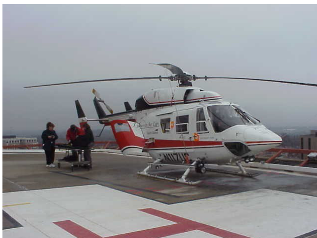
Figure 1 BK-117 EMS Air Ambulance Prepared for Flight.

An experienced operator managed the simulator while two of the investigators functioned as flight nurse and observer. Each study subject was given a one minute brief-