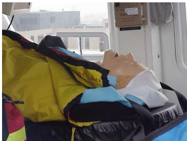
Figure 3 Simulator in Position.