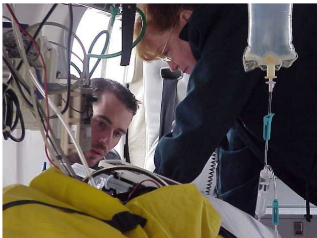
Figure 4 Instructors Making Finals Preparation for Simulation.

ing concerning the simulated patient's medical condition, prior to boarding the helicopter. One of two pre-programmed simulations was conducted for each resident. The first simulation mimicked a young woman who had been involved in a motor vehicle accident. The simulation began after she had been loaded into the helicopter on a backboard with cervical spine protection in place and with one intravenous line established. Shortly after the simulation starting point, the patient exhibited signs of hypovolemia and tension pneumothorax and requires fluid resuscitation, needle thoracostomy, and endotracheal intubation. The second simulation represented a middle-aged man sustaining an anterior myocardial infarction. He had received thrombolytic therapy and was being transferred to a tertiary care hospital for acute intervention. At the beginning of the simulation he underwent ventricular fibrillation and required advanced cardiac life support and endotracheal intubation.