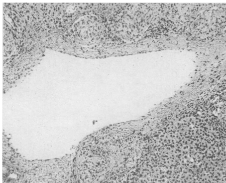
FIG. 7.—Sarcoid infiltration of the wall of a large hepatic vein. (x 60)

Subsequent course. The patient has exhibited a very gratifying clinical response since her discharge from the hospital. She resumed her lighter household duties a few months postoperatively. As her ravenous appetite continued, her weight soon increased to 144 pounds, but the persistence of the weakness of her legs led her to accept a somewhat restricted diet. One year after operation the red cell count was 3,500,000, the hemoglobin level 14.5 Gm., and the white cell count 14,400. The plasma protein concentration was 7.10 Gm. per 100 cc. representing 3.00 Gm. per 100 cc. albumin and 4.10 Gm. per 100 cc. globulin.