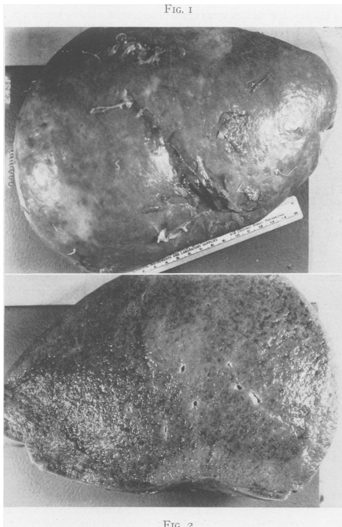
FIG. 1.—The appearance of the spleen (weight 2,250 Gm.) immediately after its removal.

The spleen measured 28 by 18.5 by 12 cm. and weighed 2,250 Gm. (Fig. 1). There were scattered fibrinous adhesions and focal areas of hyalocapsulitis on the diaphragmatic surface of its capsule. It was abnormally firm. On section it was rusty brown in color, rubbery, and uniformly sprinkled with minute, somewhat reddish areas (Fig. 2).