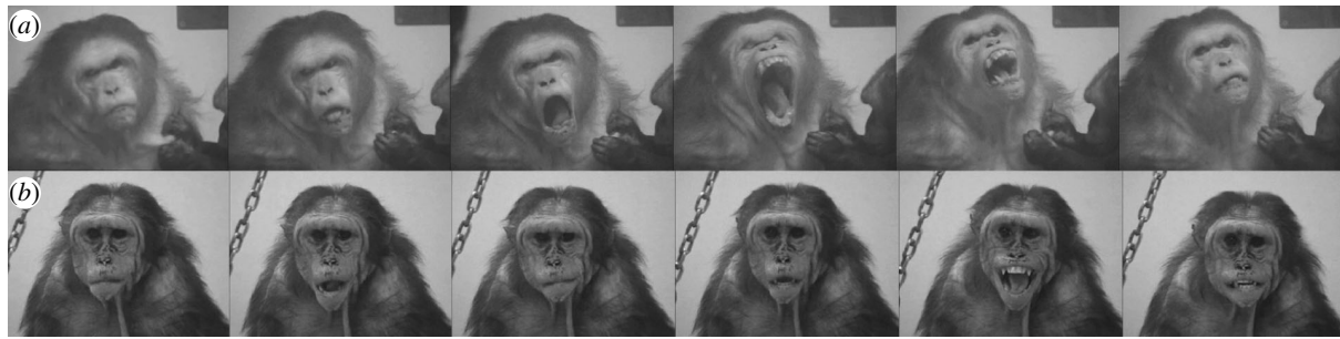
Figure 1. Frame sequences from sample videos. (a) Yawn sequence, (b) control sequence.

conducted all-occurrence sampling of yawning. For the present study, yawning was defined as a long inspiration with gaping mouth, followed by a shorter expiration. As yawning is thought to be a stereotyped motor act (Provine 1986), its occurrence was easy to recognize (see also figure 1a). We ran a total of 14 yawn and 14 control sessions.