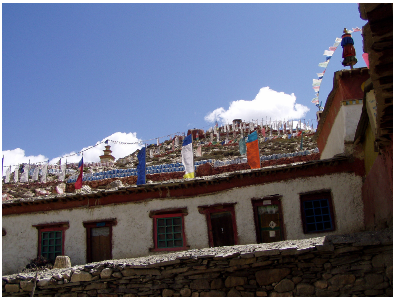
Figure 2 Monastery of Phoo

used for cough and cold, chest pain, stomachache, diarrhoea, dysentery, worms, rheumatism and gastritis and Hippophae tibetana fruit is used as a diuretic, tonic, cough and cold, to treat periods of weakness, and worms. These two species are used to treat broad range of ailments. It is very important to take immediate steps towards conservation and management aspects of these two important medicinal plants of Manang. Cultivation of these two species in the barren lands helps in conservation and management, while at the same time can improve the economic status of poorer people. Several development projects use fruits to make a now popular juice in the districts of Manang and Mustang, commonly called 'Sea-buckthorn juice'.