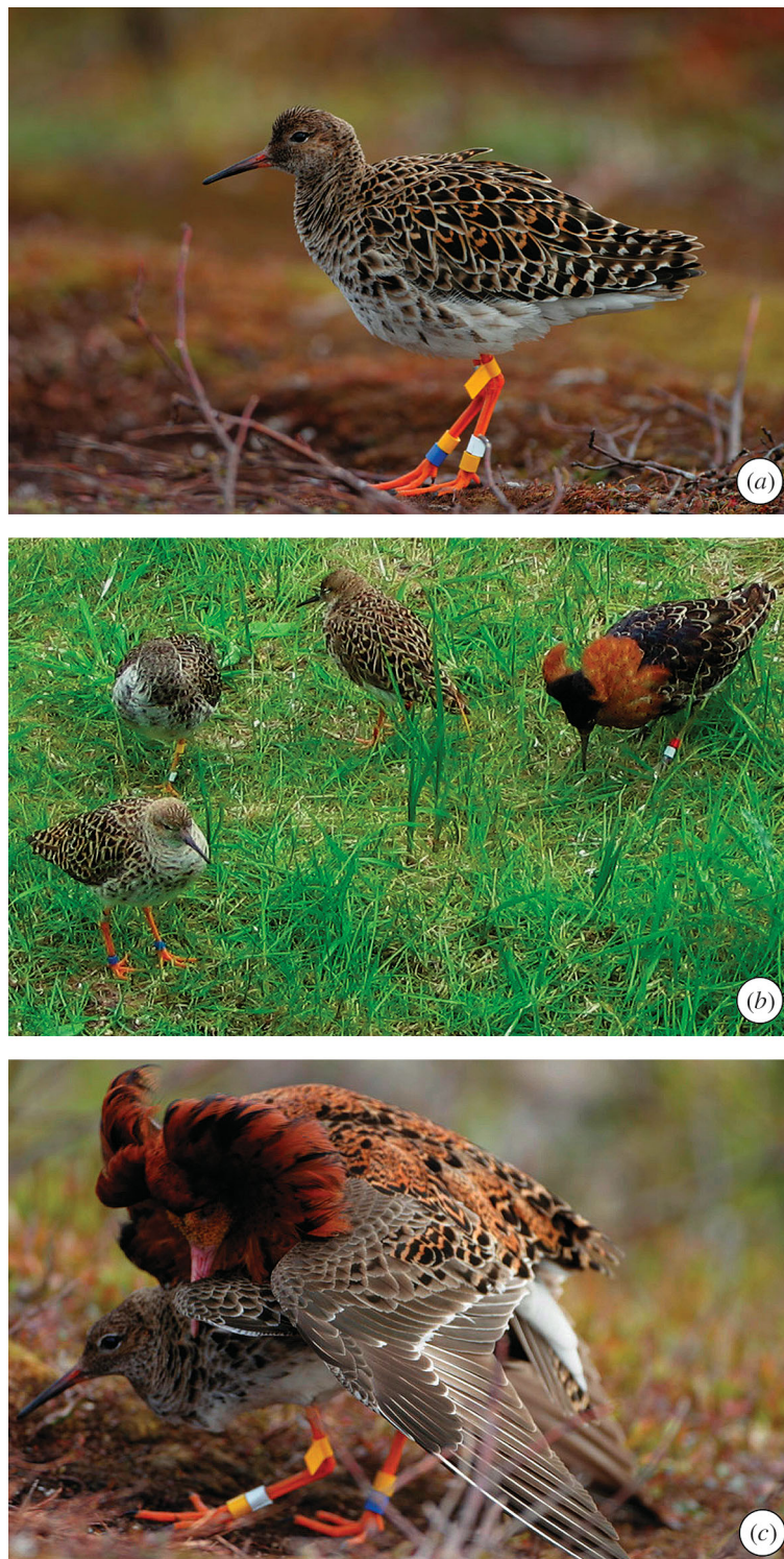
Figure 1. (a) A female mimic (or faeder), individually colour-ringed in The Netherlands on 10 April 2004, photographed while visiting a lek in Varanger, northern Norway, from 16 to 19 June 2004 (photo by J. and T. Champion). (b) On the left two female mimics, on the right an independent male and between them a single female in an aviary setting (photo by Y. Verkuil). (c) The individually colour-ringed female mimic is mounted by an independent male on a lek in Varanger, northern Norway, on 17 June 2004 (photo by J. and T. Champion).

testes of intermediate female-like birds were 2.5 times larger in volume than in normal males (average total testes volumes of 715 and 283 mm 3 in 5 female mimics and 15 normal males, respectively, caught in the period 10–25 April; pooled variance t = -3.6 , p = 0.002 ). Female mimics were aged as second year birds and older; when held for 2 years in captivity they showed no change. We have proposed to call this permanent and rare morph (1% or fewer of the birds