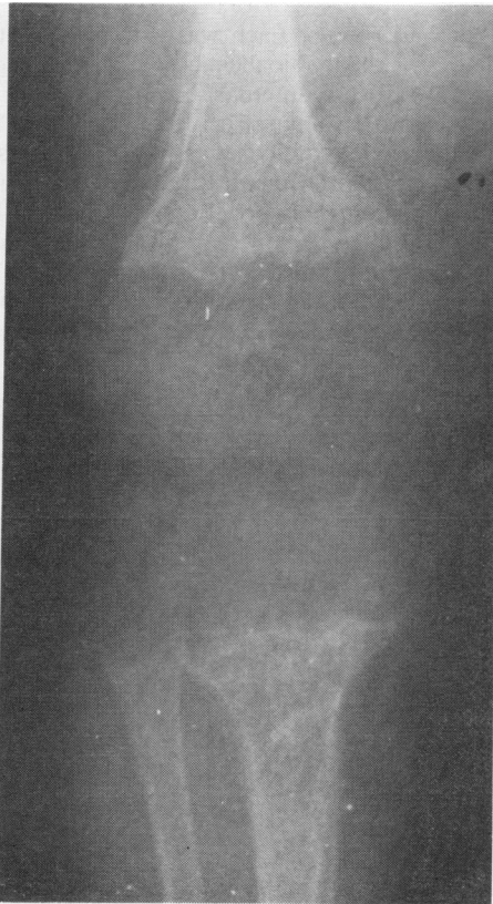
Fig. 2 (Case 1.) X-ray of right knee at age 14 weeks.