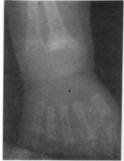
Fig. 3 (Case 1.) X-ray of right wrist at age 14 weeks.