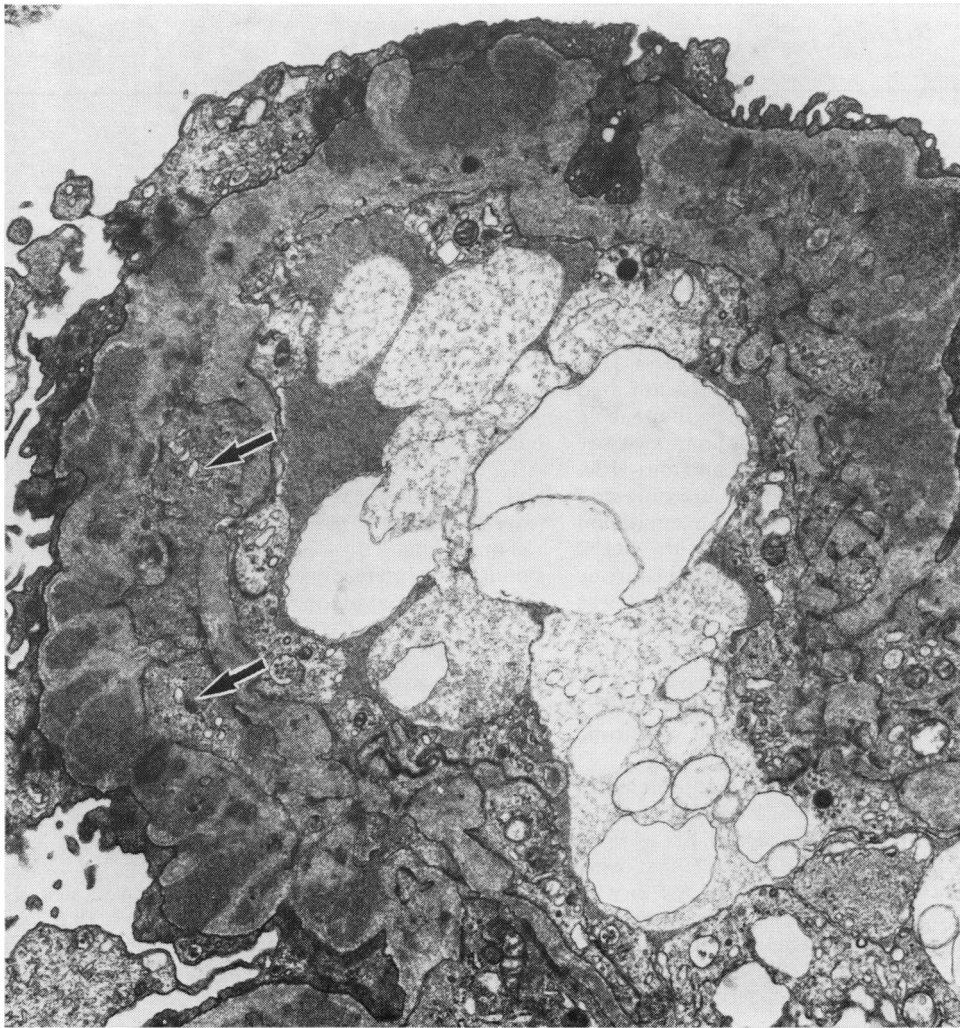
Fig. 2 Electron micrograph ( \times 16\ 320 ) of glomerular capillary loop showing many subepithelial electron dense deposits some of which are being incorporated into the thickened basement membrane. Note the interposition of mesangial cytoplasm (arrow) and fusion of the footprocesses. Late membranous glomerulonephritis.

Immunofluorescence studies showed striking granular deposition of IgG and to a lesser extent C3 and IgM in the capillary loops and less so in the mesangium. Peroxidase antiperoxidase staining for HBs antigen was negative.