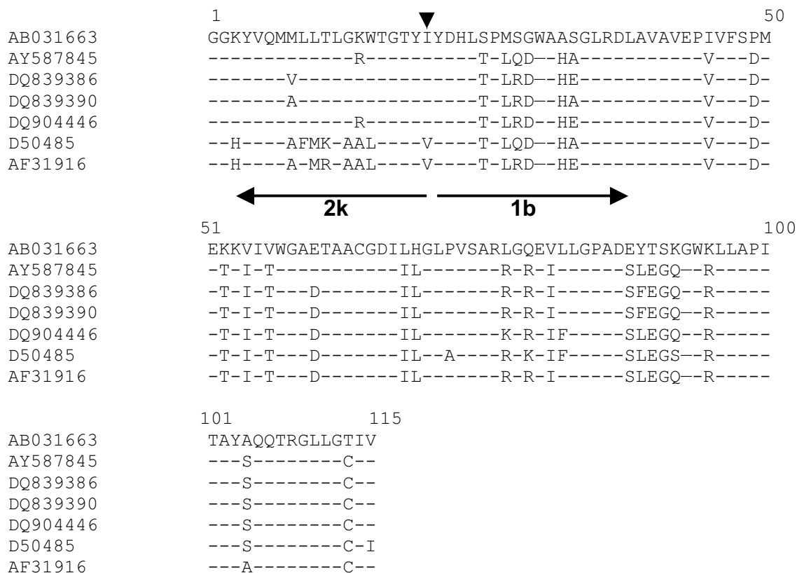
Figure 3 Amino acid alignment of sequences from sera (a) HC9A98987 [DQ839386, DQ839390] and (b) HC9A99966 [DQ904446], and reference strain [AB031663] (2k), [AY587845] (2k/1b), [D50485] (1b) and [AF313916] (1b) from the NS2 region. The recombination break point as identified by Kalinina is marked by the arrowhead. The directionality of the genotypes is indicated by the arrow, with subscripted genotype/subtype.

1b recombinant form, in Ireland was the result of a detailed molecular investigation across the genome. The RLPH pattern observed in this study may be a signature indicative of this particular type of intergenotype recombinant of hepatitis C meriting clonal analysis of NS2. Perhaps diagnostic laboratories need to consider confirmation of genotype by interrogation of the NS5B to ensure that management of chronic HCV is optimal.