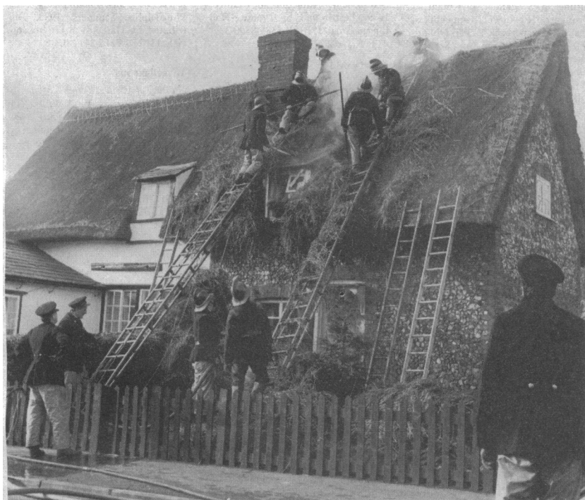
J ALLAN CASH

The incidence of domestic fires is significantly associated with unemployment, low socioeconomic status, and inversely with owner occupation. 8 Very overcrowded conditions increase the risk of fire and the difficulties of escaping from it. The Institution of Environmental Health Officers is particularly concerned about the risks in houses in multiple occupation. 9 Because of the shortage of environmental health officers, they are confined to reacting to complaints rather than able to inspect regularly. Until the service is adequately funded the poorest and most disadvantaged members of our society will not be