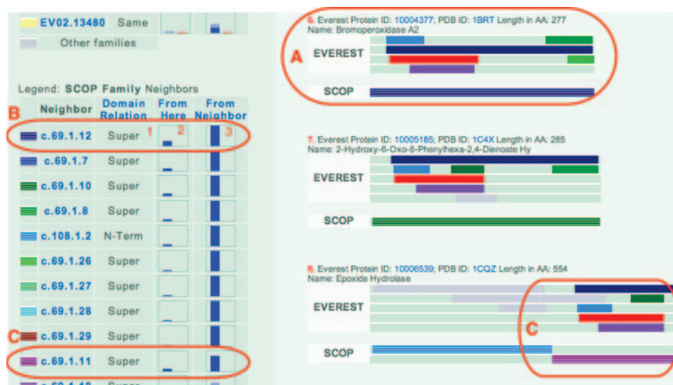
Figure 2. Relationship between EV02.00096 and SCOP c.69.1.12 . Excerpt from the family page of EV02.00096 is shown. (A) Record for PDB sequence 1BRT is highlighted. The EV02.00096 domain, in red, is a sub-domain of the SCOP c.69.1.12 domain, in striped dark blue. (B) The relationship between EV02.00096 and c.69.1.12 is described by (1) the keyword 'Super' indicating that c.69.1.12 domains are super-domains of EV02.00096 domains, (2) the left bar graph, which through the height of the bar indicates that less than a quarter of EV02.00096 domains participate in this relationship and (3) the right bar graph, indicating that all of the domains of c.69.1.12 participate in this relationship. (C) EV02.00096 is also a super-family of sub-domains of c.69.1.11 .

Some criteria definitions, especially those involving phylogenetic profiling, may produce searches that require several