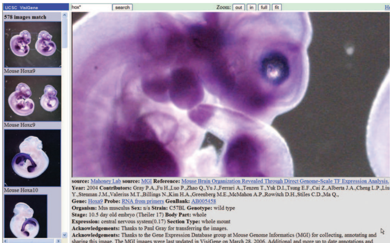
Figure 1. Screenshot of VisiGene display for mouse Hoxa9 gene.

VisiGene provides a series of thumbnail images in a panel to the left of the main viewing area and fully annotated full-resolution images in the main viewer area to the right (Figure 1). These are high-resolution images viewable in a